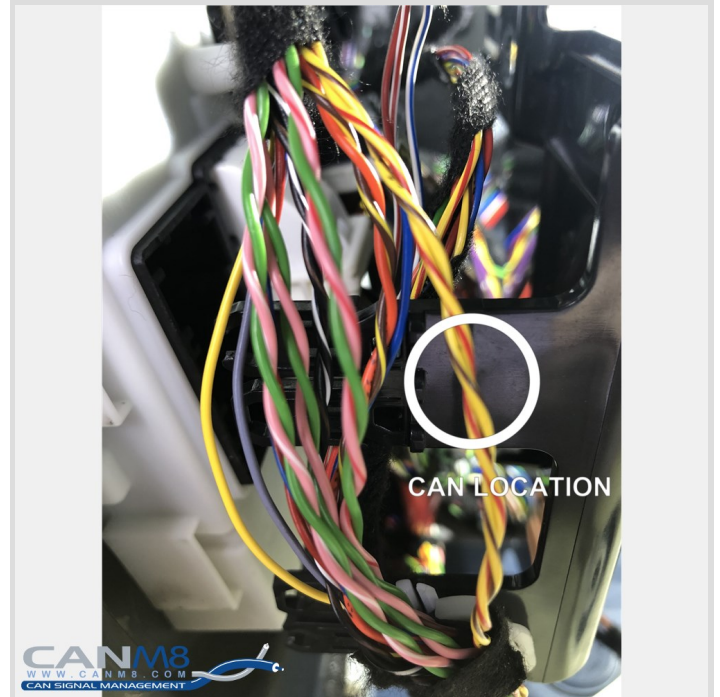
Yellow / Red & Yellow / Brown CAN wiring