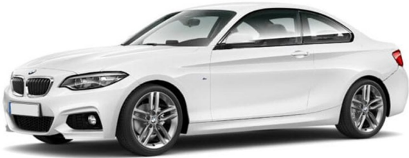
BMW 2 Series